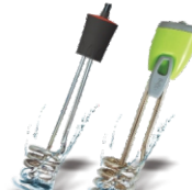
IMMERSION WATER HEATERS