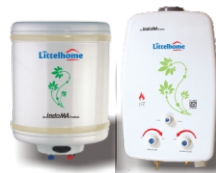
ELECTRIC / GAS GYSERS