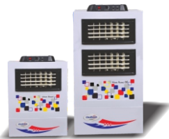
HAWA HAWAI COOLER